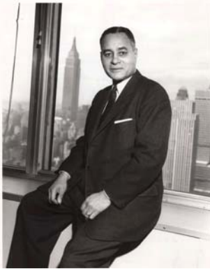
Dr. Ralph Johnson Bunche