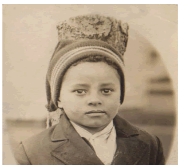
Ralph Bunche in Detroit, circa 1910

The students most enjoyed roundtable discussions on the impact of diversity in their own lives and group activities that simulated debate in the United Nations. The students argued and passed resolutions to improve politics, the economy, the environment, and health issues on the African continent. At a final assembly, students were given awards for their participation and dedication to learning about conflict resolution in the spirit of Dr. Bunche by the Detroit Tigers and Wayne State University. Four students were chosen by their peers to be honored by the Ralph Bunche Summer Institute Nobel Peace Prize for admirable effort in peacemaking throughout the week's events. The Institute successfully informed the students on the life and legacy of Dr. Bunche while imparting the importance of supporting harmony in their own lives and the world as a whole.